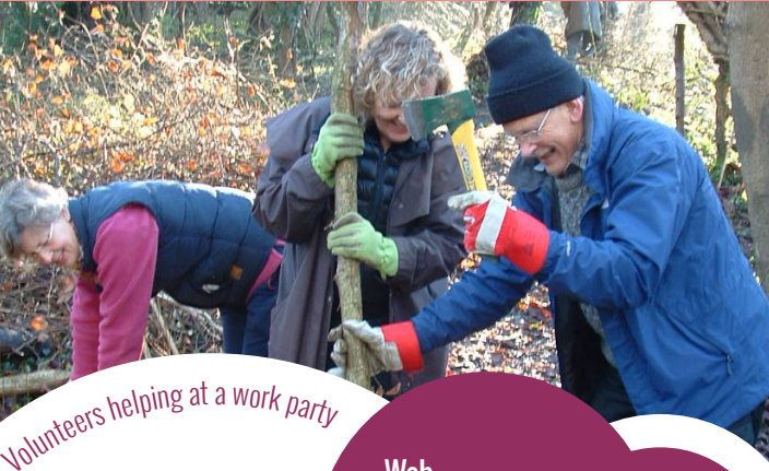
Volunteers helping at a work party