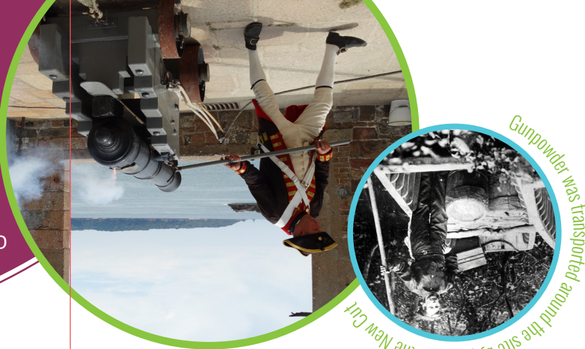
Gunpowder was transported around the site by punts on the New Cut

Once in barrels, the gunpowder was mostly sent by wagon to the Wey navigations and down to magazines on the Thames, and at times some went to Portsmouth. It was used for military and sporting powder, and blasting in mines. The prismatic powder was pressed into hexagonal prisms for large guns.